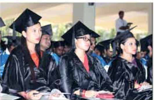
First Convocation - 19 September 2012