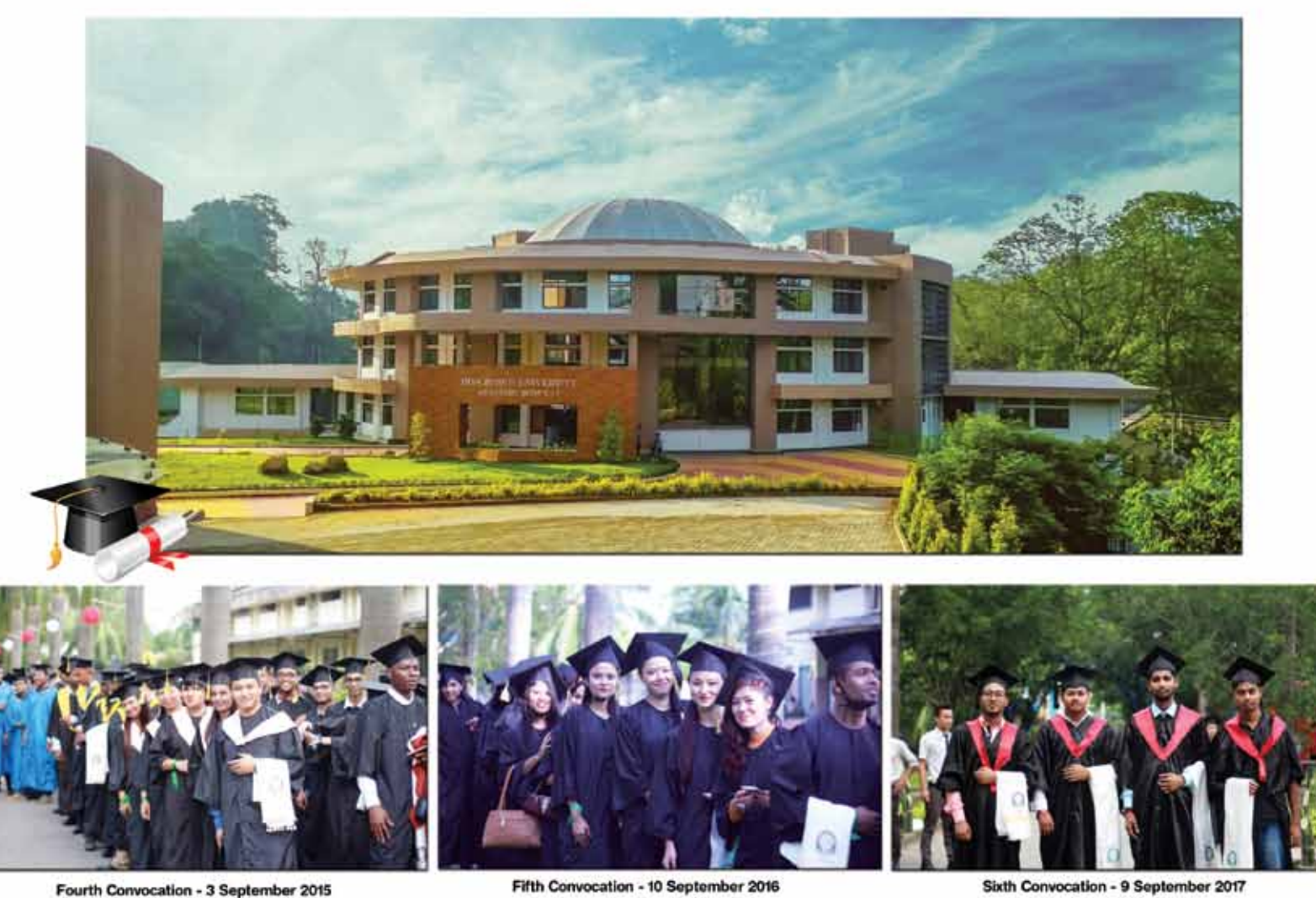
Fifth Convocation - 10 September 2016